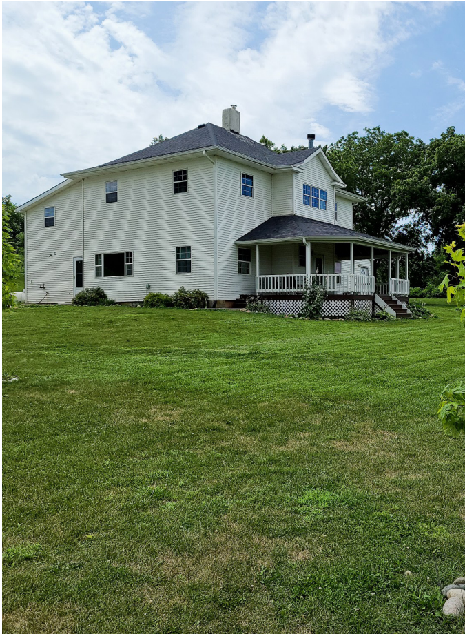
Residence for the secular seminarians