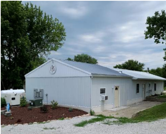
Our seminary chapel and classroom