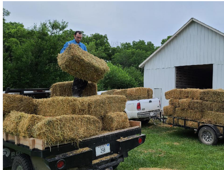
Summer chores for the seminarians include moving and stacking alfalfa