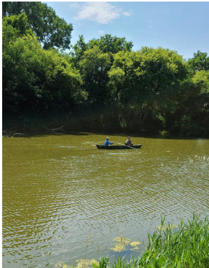
Treating and maintaining the seminary pond