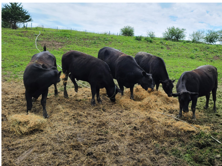
Our cows are a cross between black Angus and Jersey; Jerseys provide high quality, creamy milk, and Angus are noted for their meat