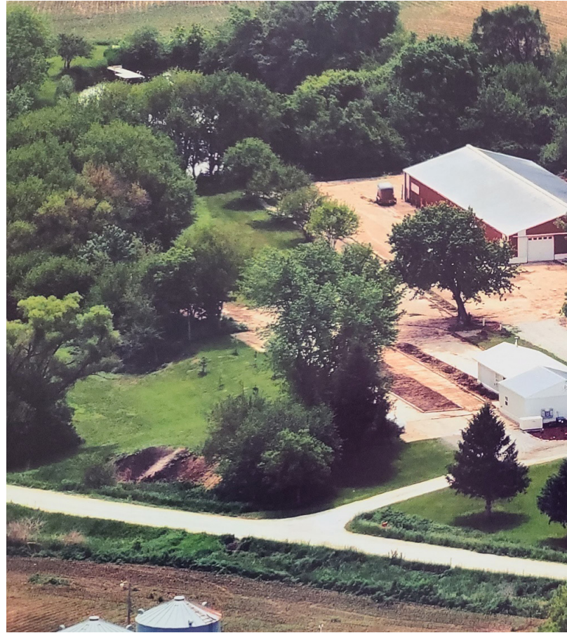
Aerial view of the seminary