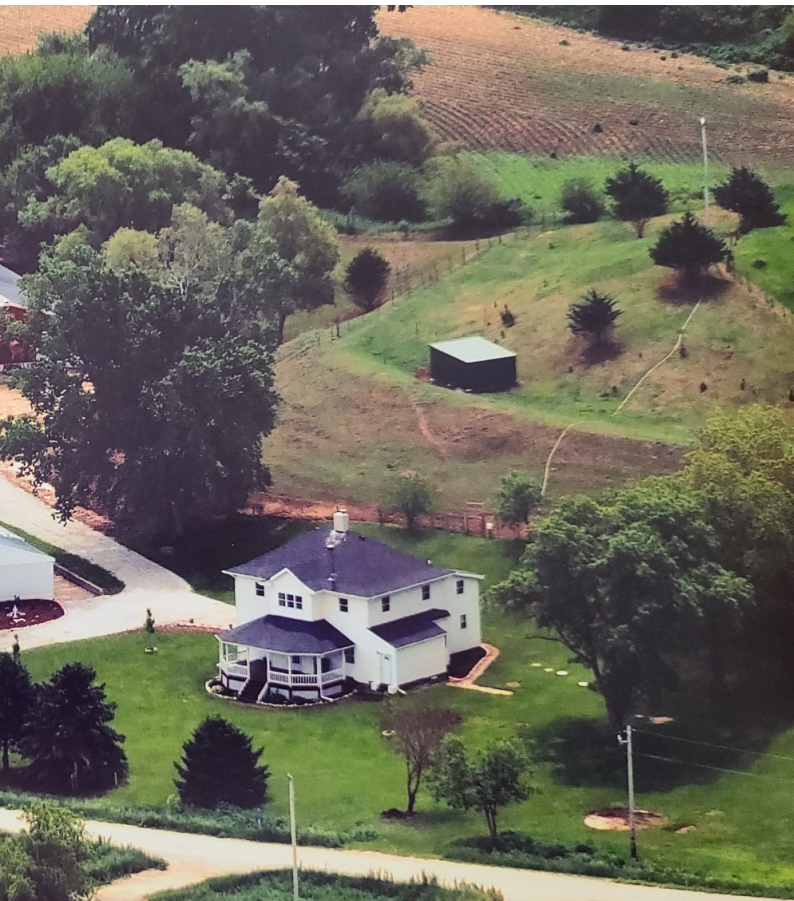
Property in western Iowa