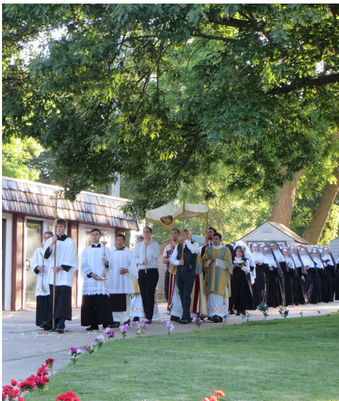
Our Lord blessed us with excellent weather for our procession in His honor