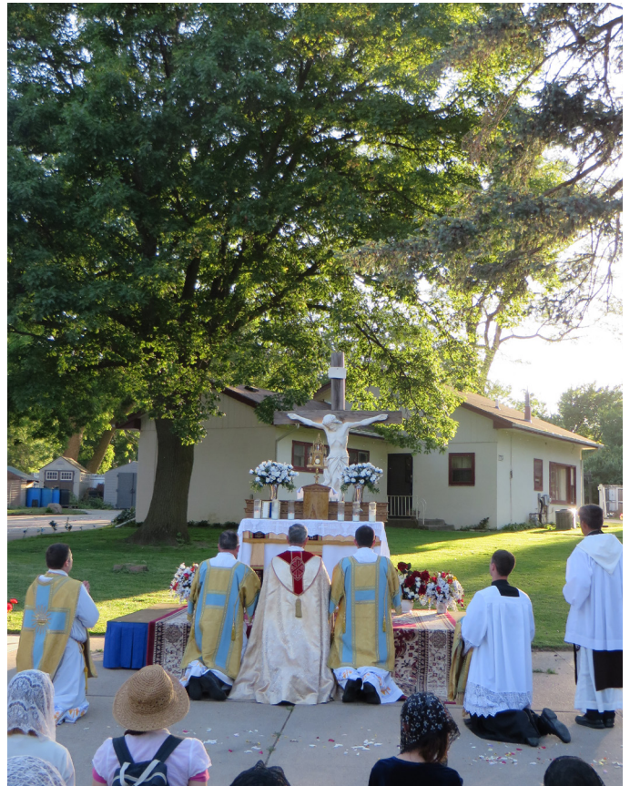
The setting sun radiated its rays on our outdoor altar and on Our Lord in the monstrance

During the past few weeks the sacred liturgy has been particularly rich in the celebration of feasts of our precious Catholic Faith: Pentecost with its octave, the Holy Trinity, Corpus Christi, and now the Sacred Heart of Jesus. How wonderfully our Holy Mother the Catholic Church presents to us these sacred mysteries of our Faith! Throughout the entire year, each Sunday focuses on the various aspects in the life of Our Lord and each day we have the heroic lives of the saints to inspire us. Where would we be without the Sacred Liturgy? How would we keep the sacred truths of our faith always before our minds? How easy it would be without the Sacred Liturgical seasons and feasts