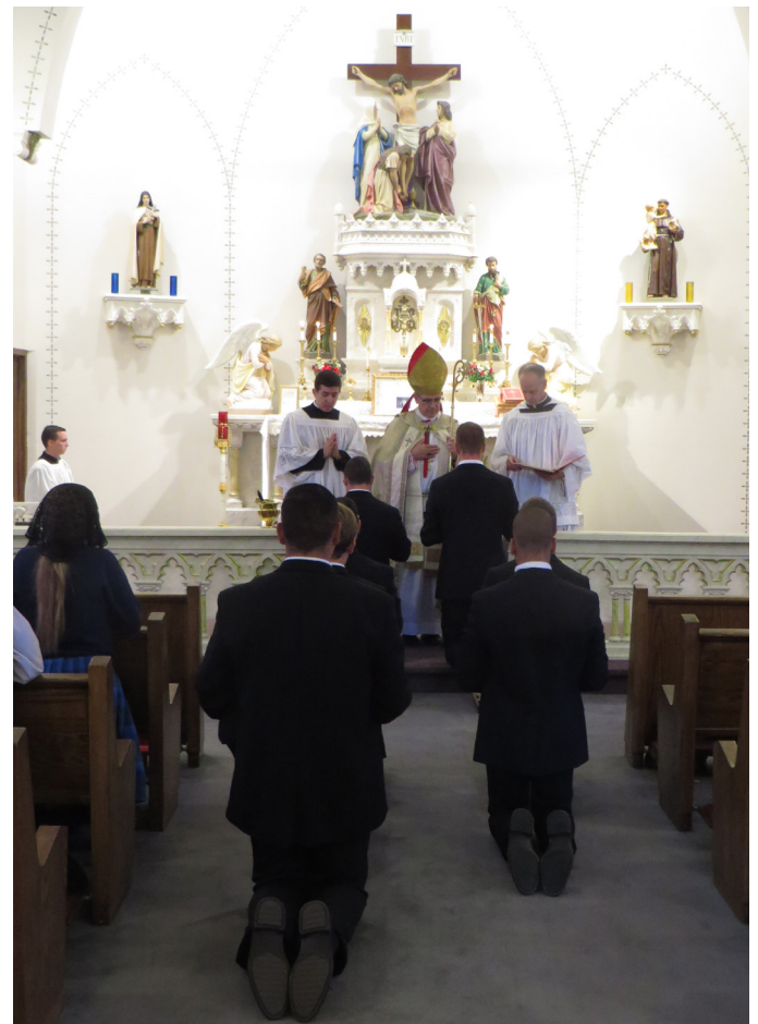
Reception of religious postulants and of the cassock for secular seminarians