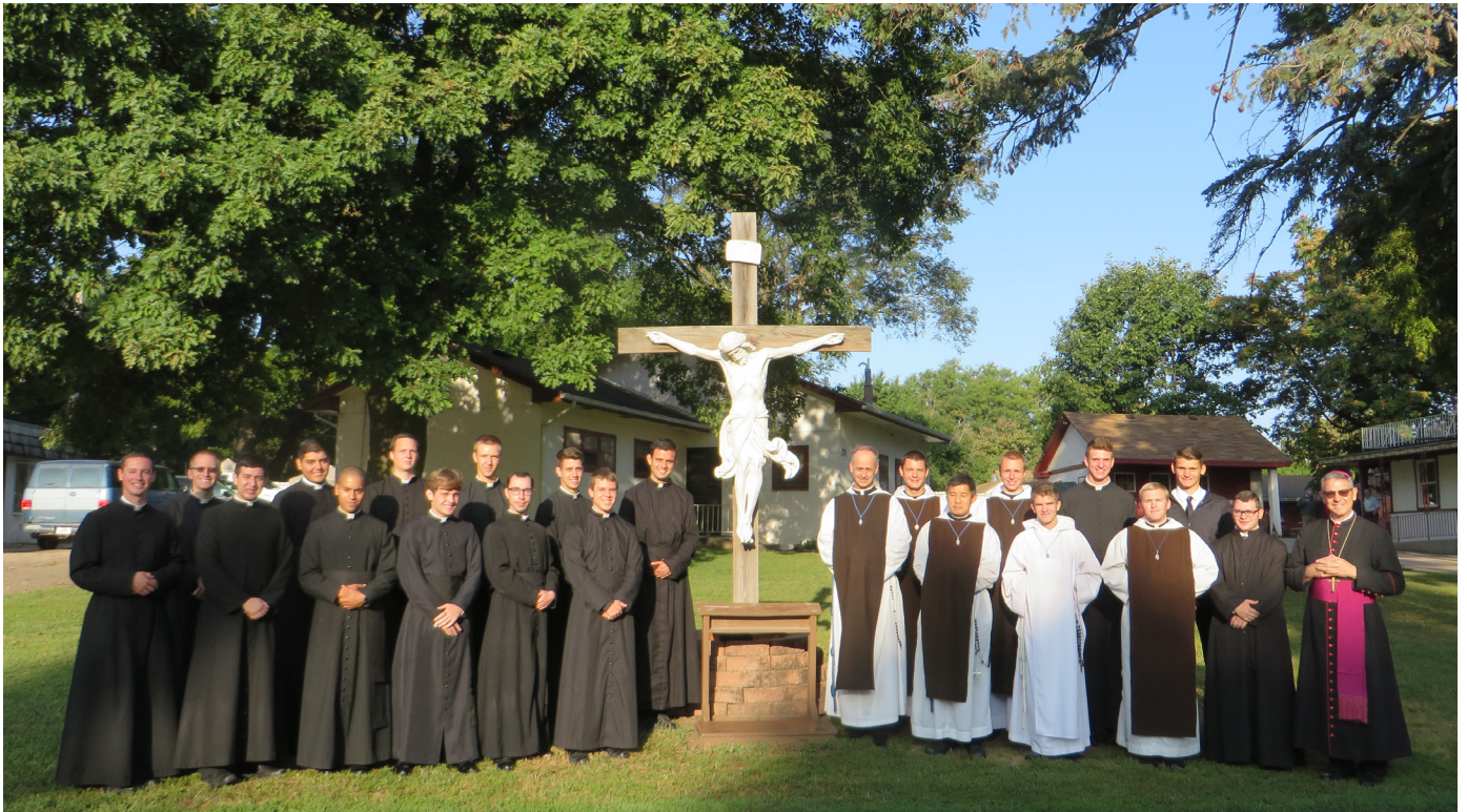
Mater Dei Seminary 2020