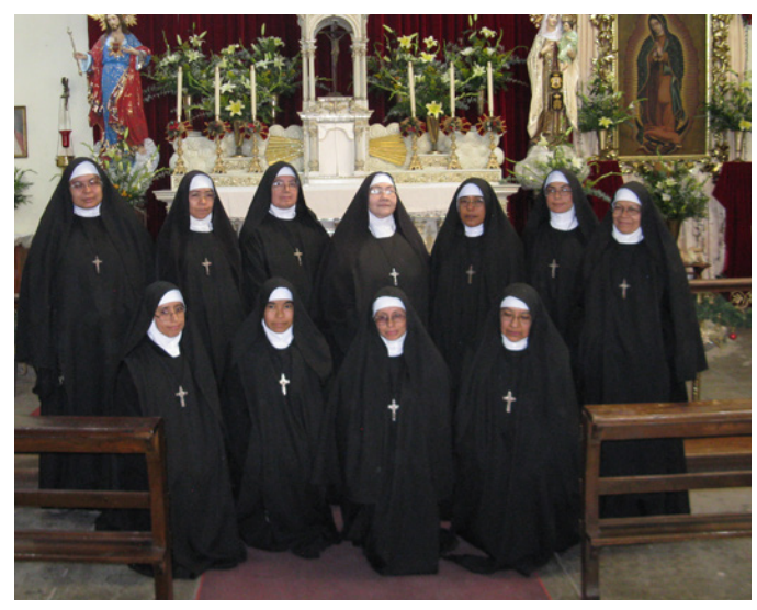
The Sisters of Divine Providence