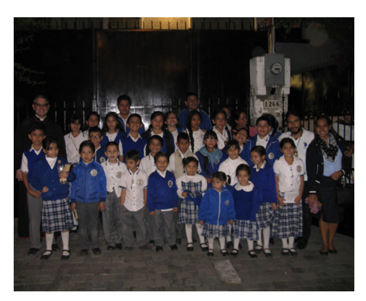
San Jose Academy

1917 Code of Canon Law, promulgated by Pope Benedict XV.