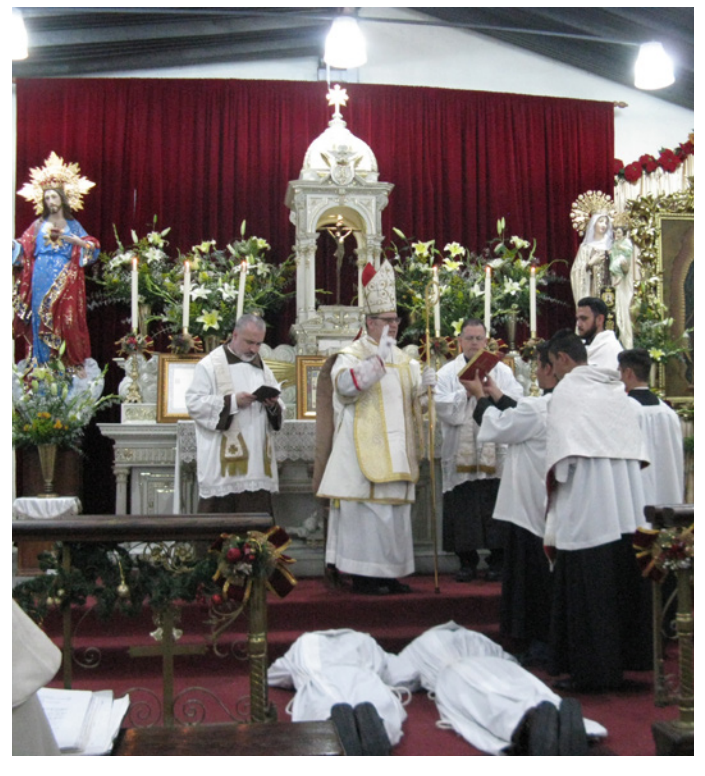
Ordination to the Subdiaconate in Guadalajara, Mexico

Father of both groups, I took the opportunity to give them a conference on the religious life, devotion to the Blessed Virgin Mary, and the relevance of the Message of Our Lady of Fatima (2017 is the 100th Anniversary of Our Lady's apparitions).