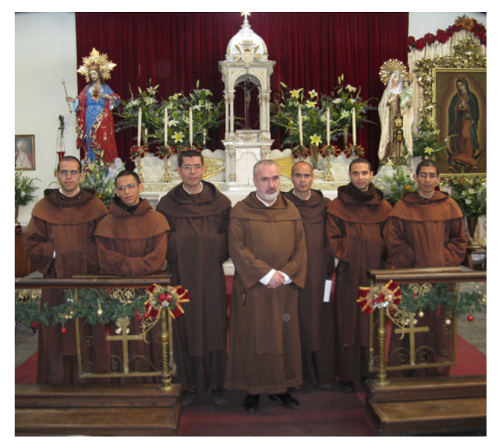
The Carmelite Fathers and Brothers