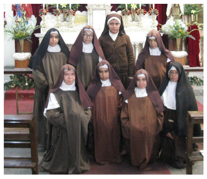
The Carmelite Sisters