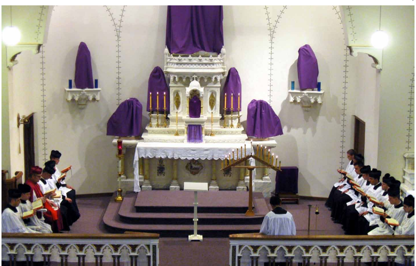
The clergy and seminarians chant Tenebrae, the Divine Office of Matins and Lauds for Holy Thursday

"The word cleric is derived from the Greek kleros ,