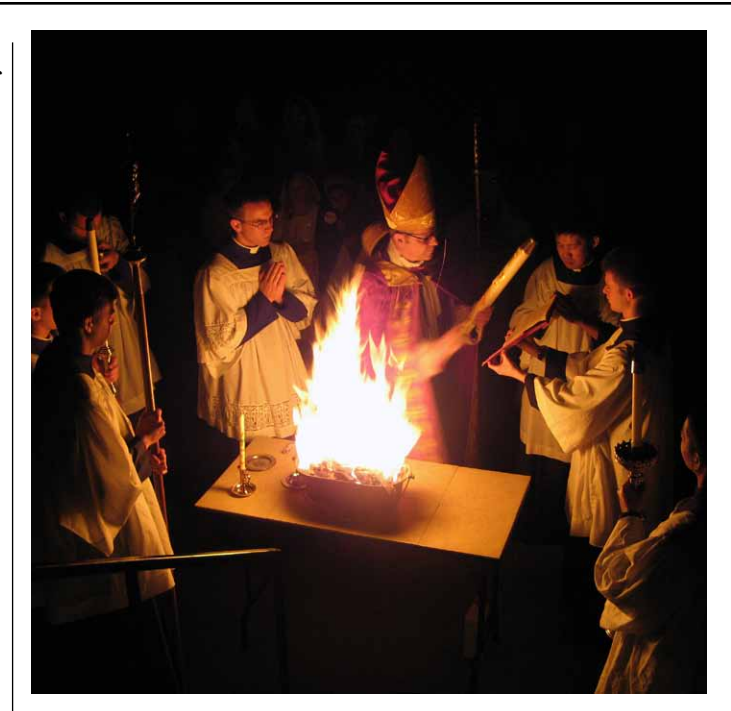
Blessing of the Paschal Fire: "O truly blessed night which alone deserved to know the time and hour when Christ rose again from the dead."

This ceremony begins with the call of the assistant priest, "Let all those to be ordained to the first clerical tonsure come forward," after which he announces the names of each candidate. The seminarians respond with the Latin word, "Adsum," that is, "I am present," and advance into the sanctuary to show that it is of their own free will that they receive tonsure. In the future reception of the minor and major orders, they will be again called by the assistant priest and will in like manner respond, "Adsum."