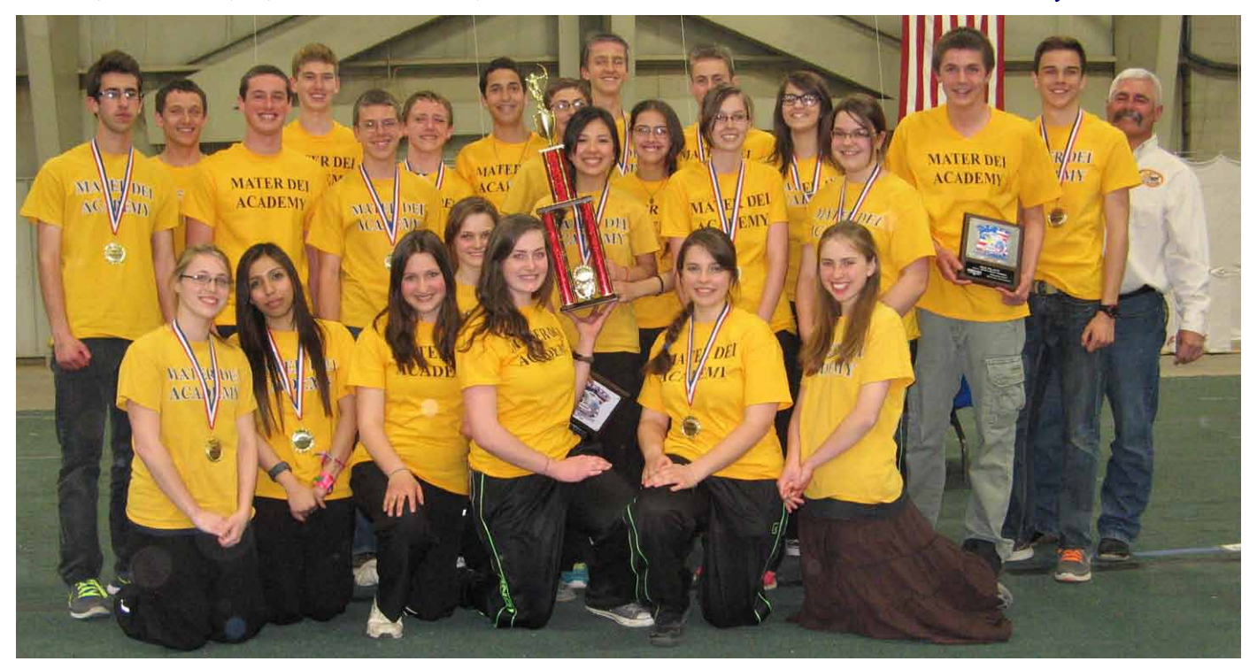
Mater Dei Academy Archery Team won the State Tournament for the fifth consecutive time and set a new state record. This month of May, they competed at the National Tournament in Louisville, KY, and out of 164 high schools, Mater Dei Academy ranked 20th in the country.