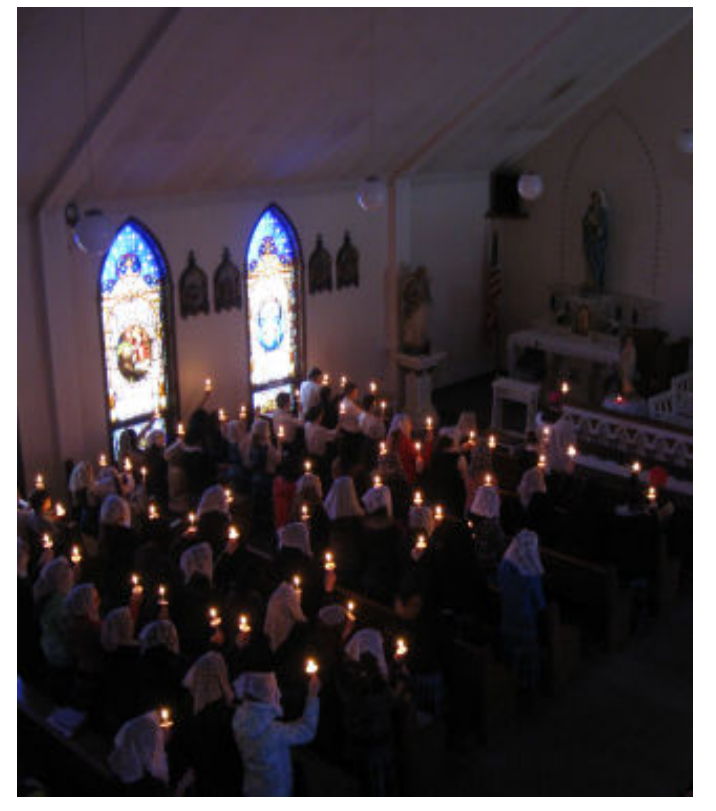
Candlelight Rosary in honor of Our Lady of Lourdes on February 11th