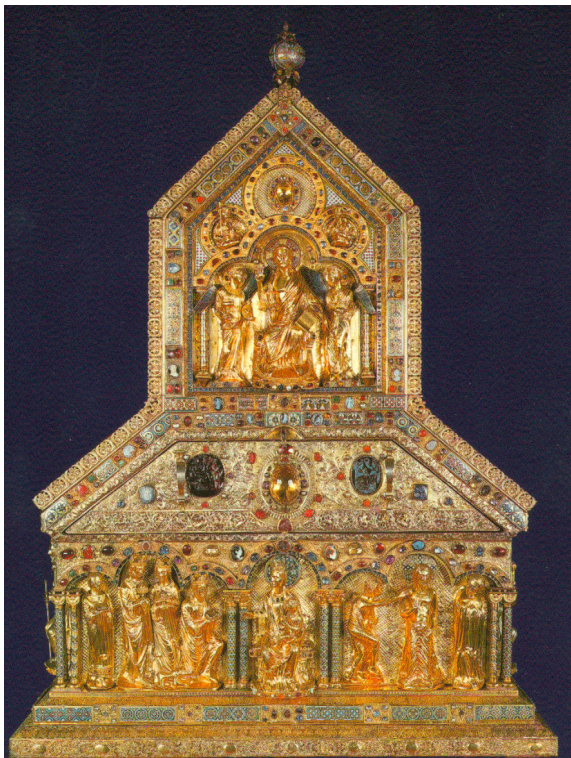
The Relics of the Three Magi

There can be no doubt that they encountered many inconveniences on their journey, but the greatest difficulty,