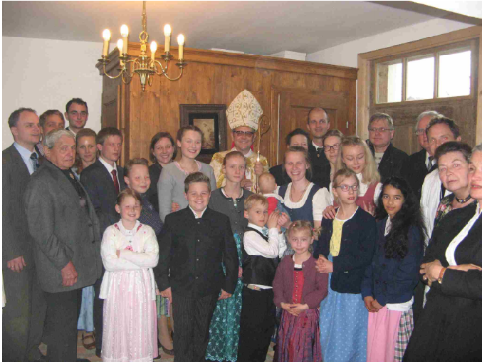
Mass and Confirmations in Darching, Germany