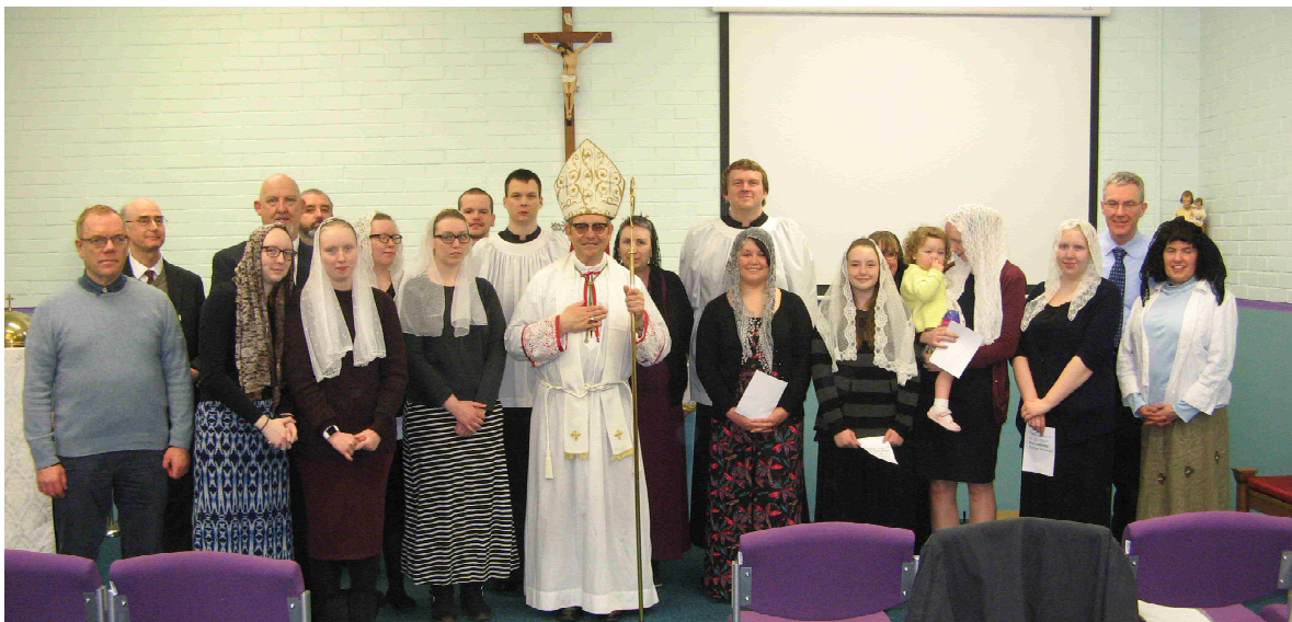
Confirmations in Edinburgh, Scotland