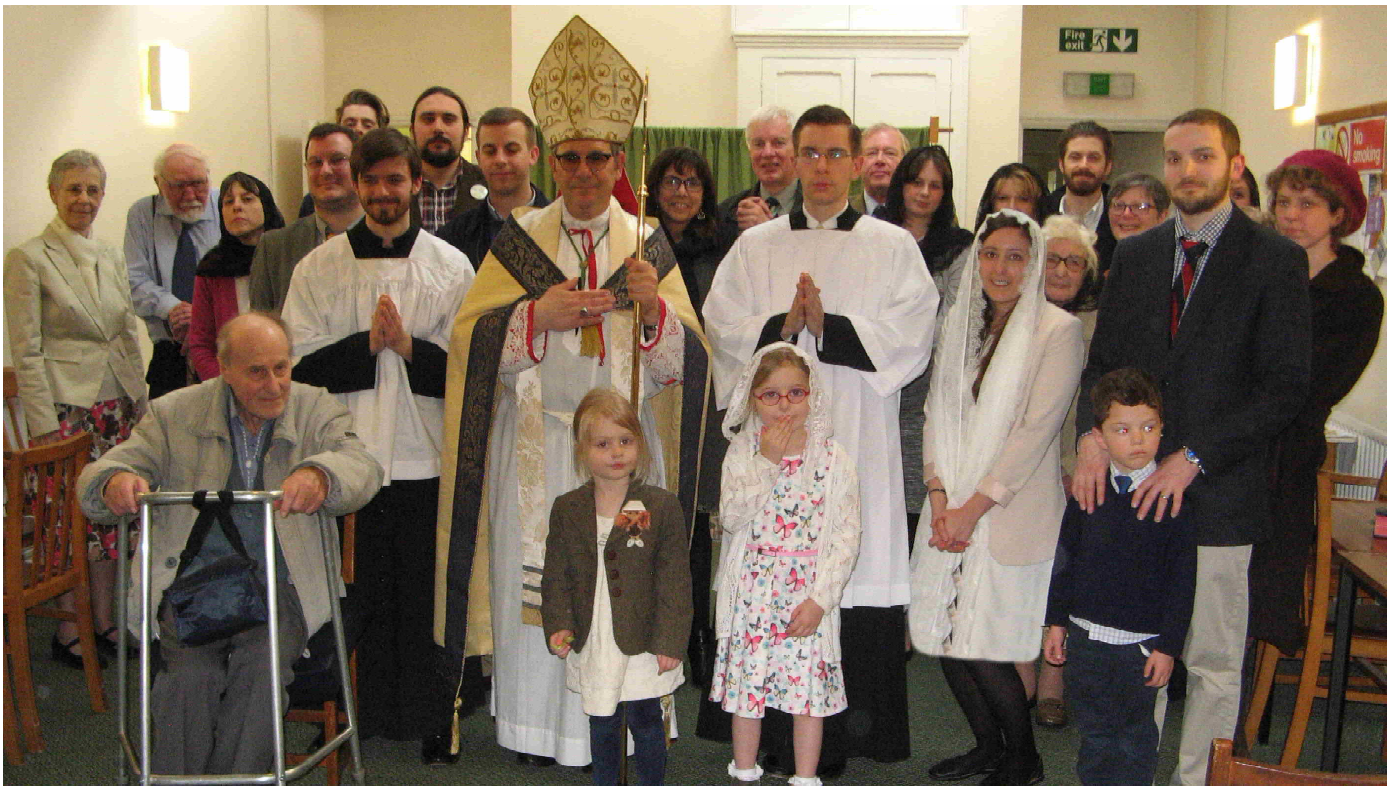
Mass and Confirmations in Ely, England