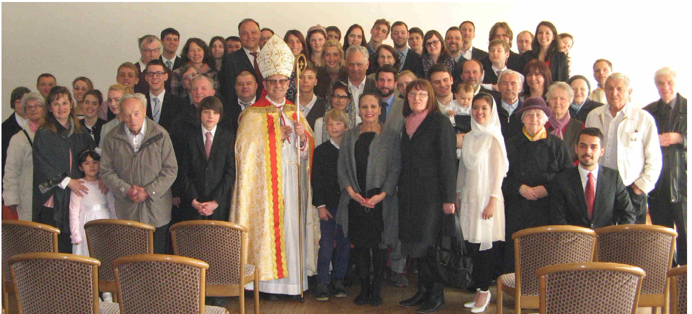
Mass and Confirmations in Ulm, Germany