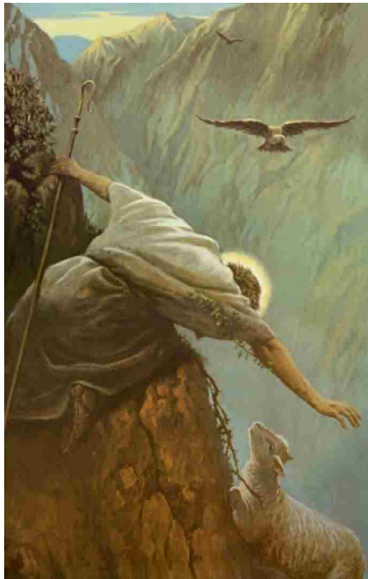
The Good Shepherd and the Lost Sheep