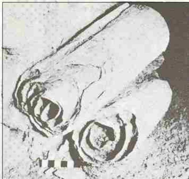
Copper Scrolls Found at Qumran

In 1947 the Bedouins discovered caves near the ruins of the ancient city of Qumran west of the Dead Sea. The original inhabitants of this city seem to have been members of a Jewish sect whose origins date back to the time of the revolt of the Machabees in 166 B.C. With the help of vessels and utensils that were found during a systematic excavation of the caves two years later, scientists were able to determine the time when the place had been deserted. The same type of objects were unearthed in the ruins of Qumran that was destroyed during the time of the Jewish revolt (66-70 A.D.). This revolt caused the destruction of Jerusalem (including the temple) by the Roman Emperor Titus in 70 A.D.—an event predicted by Jesus: “no stone