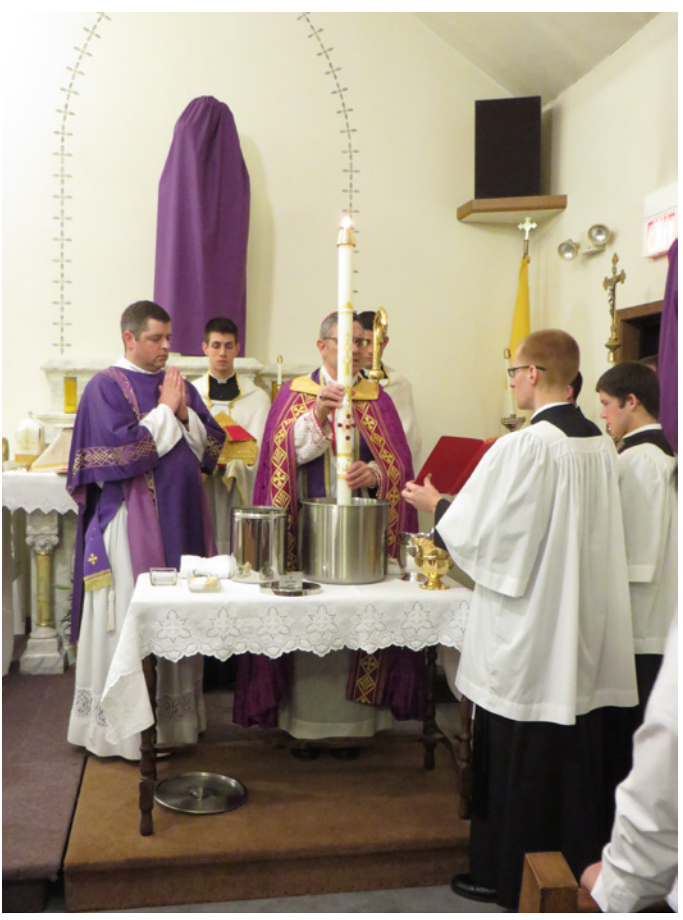
Top left: Blessing of the Paschal Fire and Candle

Bottom left: Chanting of the lessons for the Easter Vigil