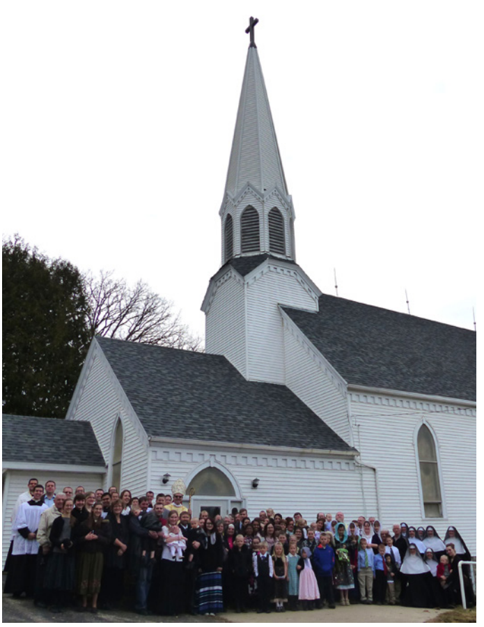
Blessing of St. Joseph Catholic Church in Harmony, Minnesota, on the Feast of St. Joseph