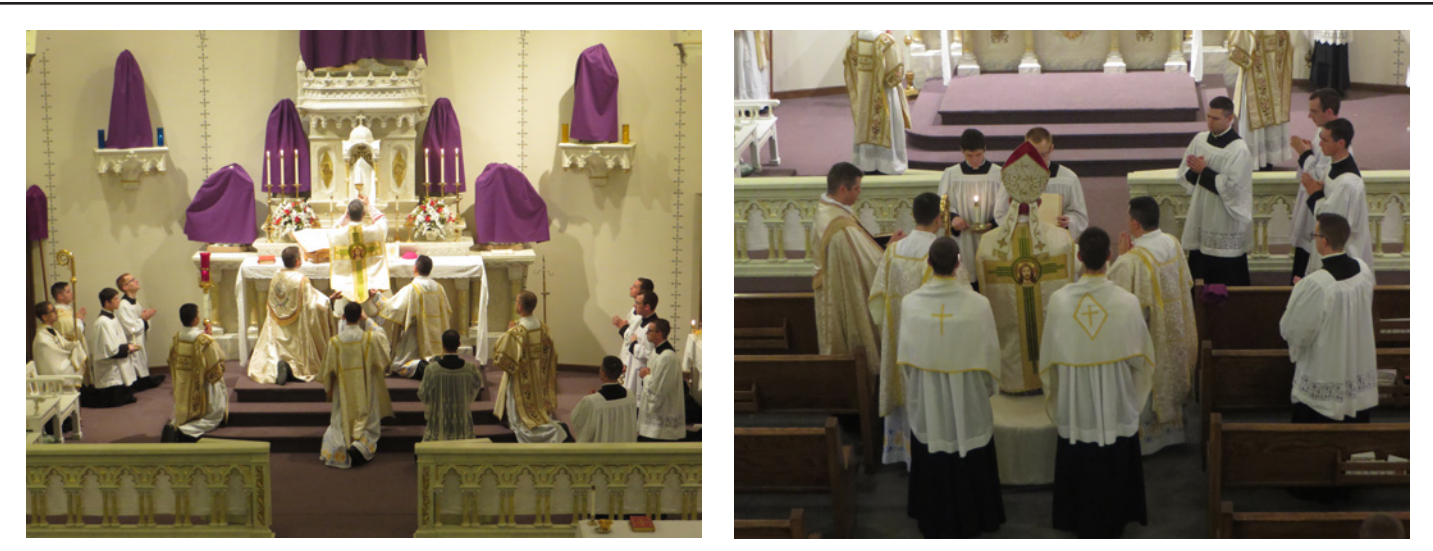
The Pontifical Mass of Chrism with the blessing of the Holy Oils on Holy Thursday morning