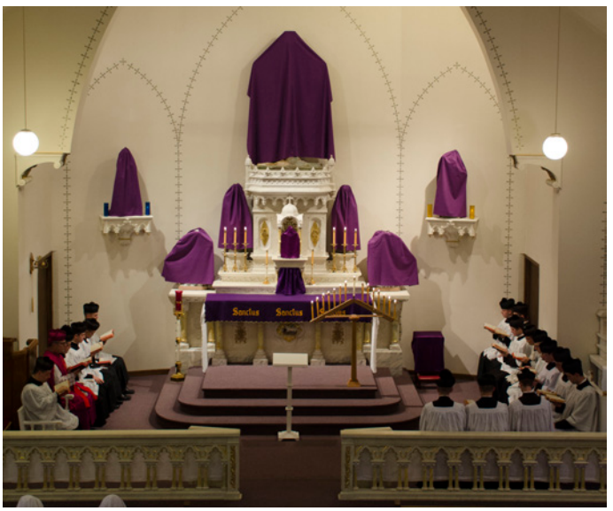
The priests and seminarians chant the beautiful psalms and lessons of Tenebrae on Wednesday of Holy Week

year, there is a much shorter period between Easter Week and the conclusion of our seminary classes and the advancement of our seminarians toward the priesthood. In three weeks, four of our seminarians will receive First Clerical Tonsure, another four of our seminarians will receive their last two minor orders of Exorcist and Acolyte, one of our religious seminarians will receive the Subdiaconate and another religious seminarian will receive the Diaconate. Please remember them in your prayers as they build their spiritual foundation for the holy priesthood.