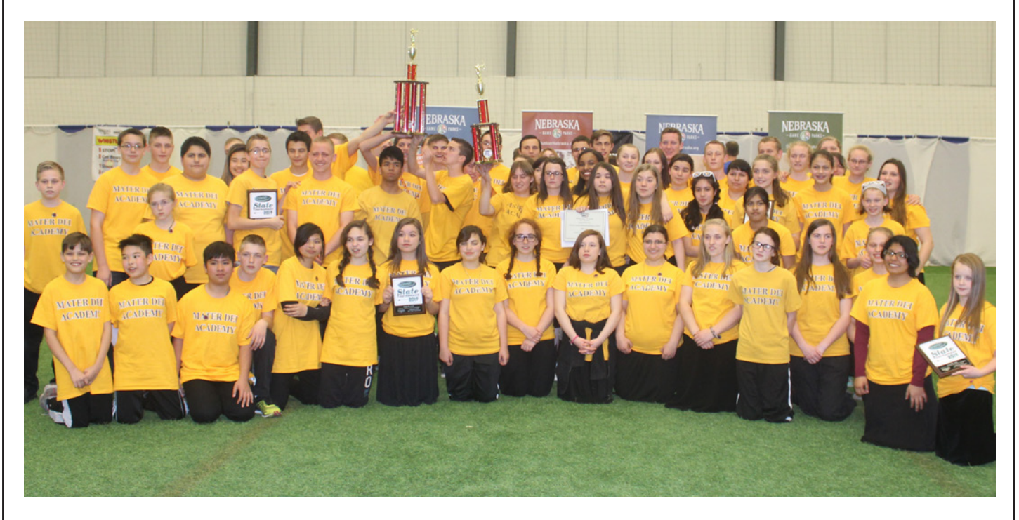
Mater Dei Academy 2017 High School Archery State Champions